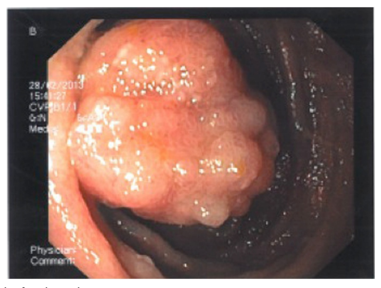
Figure 3 Peutz-Jeghers polyp found at endoscopy.